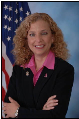
Debbie Wasserman Schultz

October 8, 2013 | US Navy Memorial, Washington DC